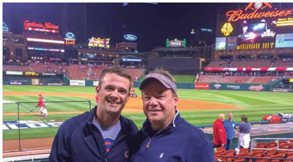
Taking in a Cubs/Cards game with his father. The duo have been to 27 of 30 MLB parks so far.